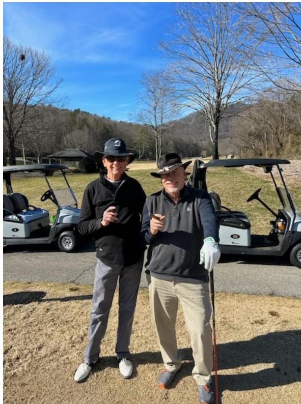
The Senior Warden and Priest exercise in Pastoral Care!